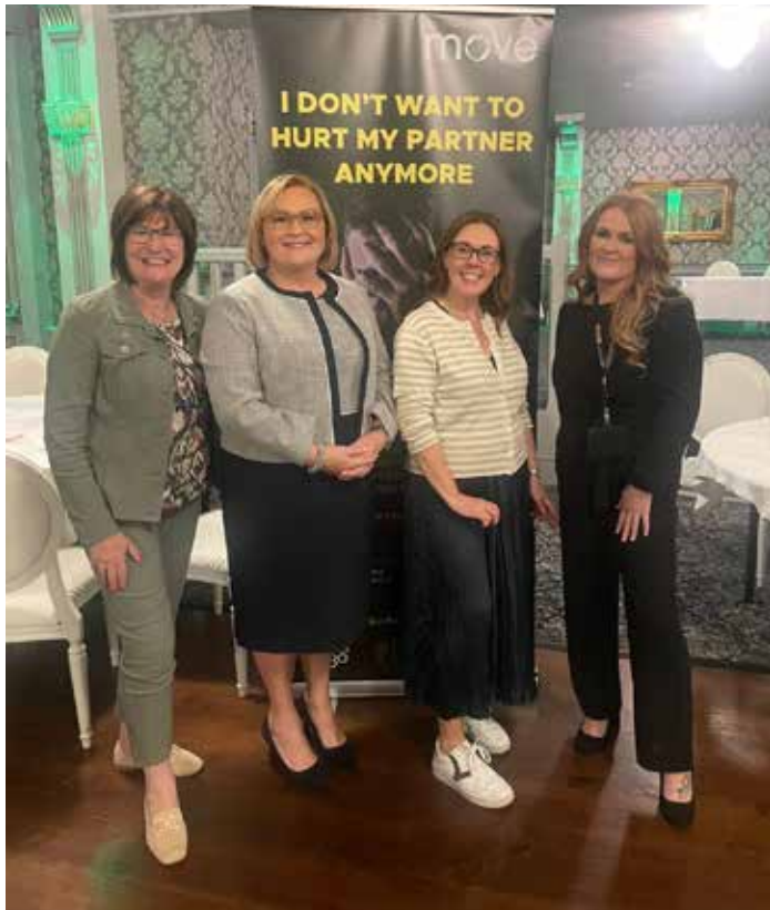
MOVE Ireland collaborated with MANTRA Strategy at this year's National Training Conference in the Anner Hotel, Thurles, Co. Tipperary